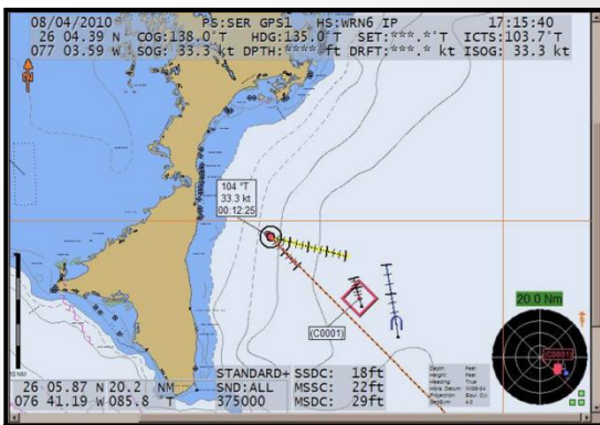
COGENT Navigation Software