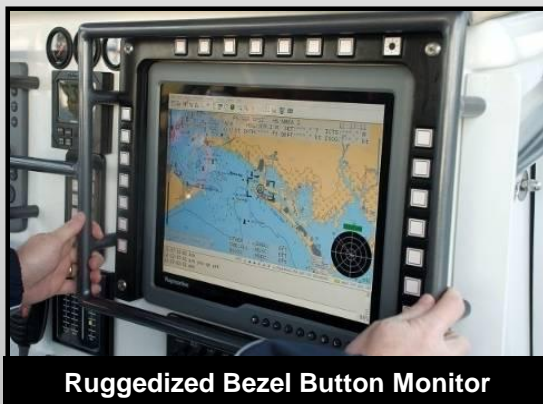
Ruggedized Bezel Button Monitor