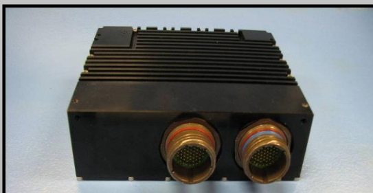
COM Express Computer